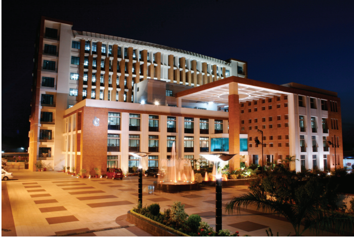
Gaurav Tower, the new corporate office for Bansal Classes.