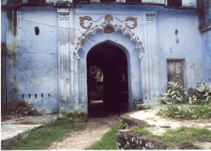
Bansal's ancestral house in Lucknow.